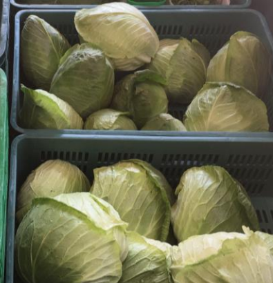
Harvests: Marmande tomatoes, scallions, tender zucchinis, abundant cabbage, Natsufushinari cucs, chayotes, purple lettuce and roses, herbs, and palmito!