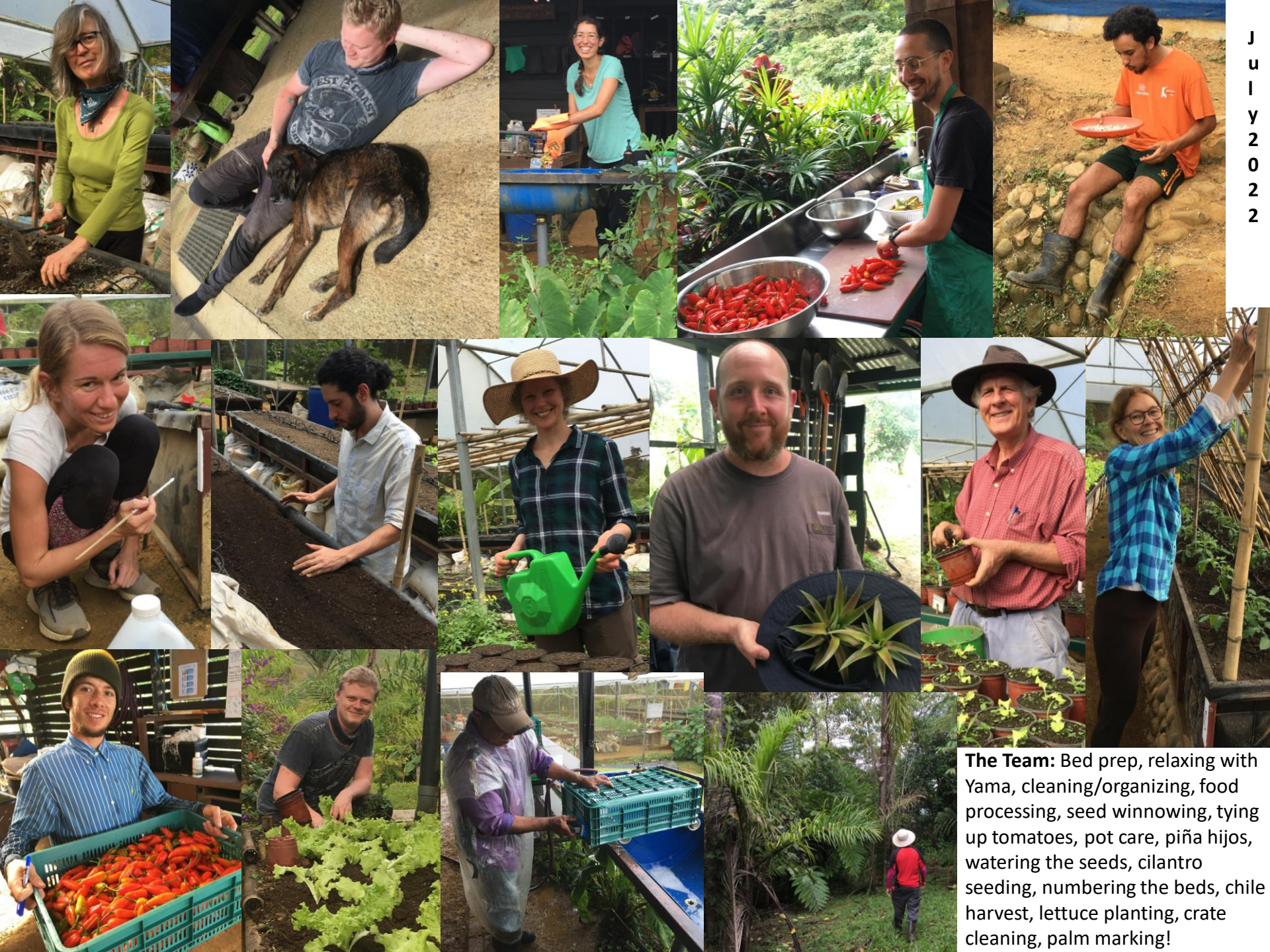
The Team: Bed prep, relaxing with Yama, cleaning/organizing, food processing, seed winnowing, tying up tomatoes, pot care, piña hijos, watering the seeds, cilantro seeding, numbering the beds, chile harvest, lettuce planting, crate cleaning, palm marking!