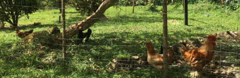
Harvesting, constructing, trellising, reviewing, and the newest members of the team, chickens!