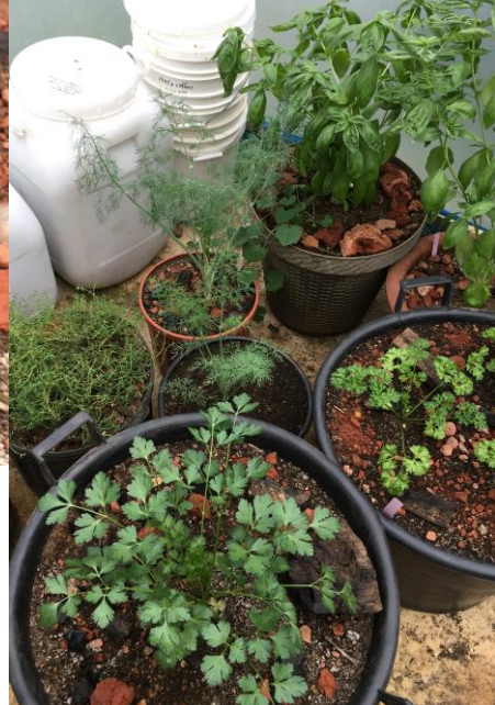
Summer Herbs growing strong! Basil, parsley, dill, thyme, rosemary, and oregano!