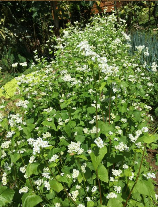
And buckwheat in flower for seed saving!