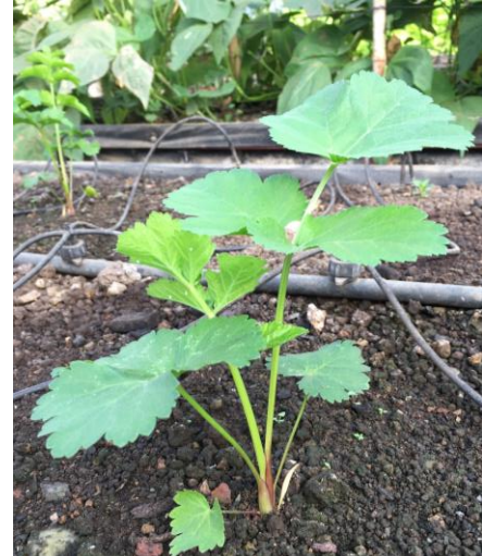
The next generation of parsnips from the seeds we've saved!