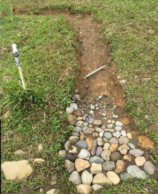
The south side of Al-Kauthar looking amazing after cutting back forest and building a retention to widen/level the space and help with water runoff. Improving drainages in Svarga and at the Spurana faucet.